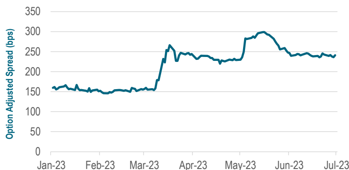
Large Regional Bank Spread Volatility Around 2023 Crisis